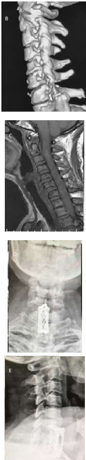
Figure2: A: the electric grinder in the endoscope removed the superior border of left superior articular process and part of lamina of C7. B and C: The cervical dislocation was reduced and the spinal cord compression was relieved completely. D and E: The operation of fusion and fixation by the anterior cervical approach.