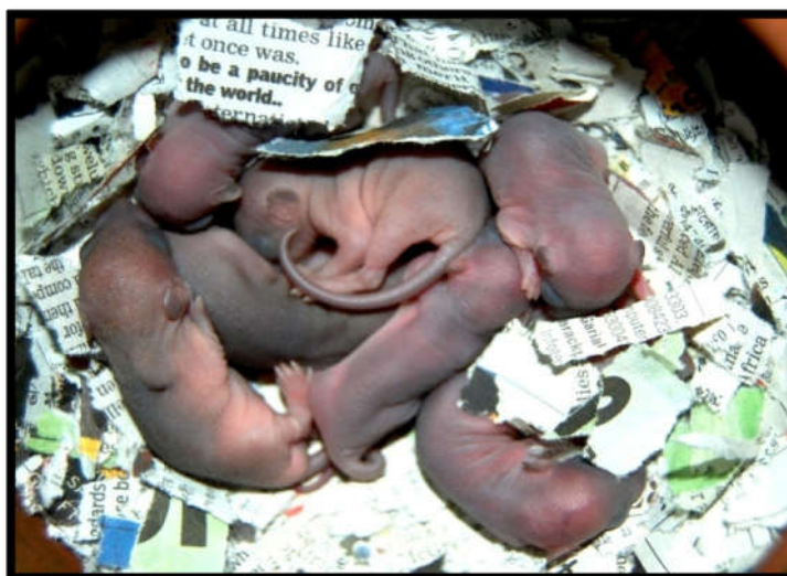
Figure 1. Photograph showing the litters of the Rattus sikkimensis . The young were in clumped condition when they were in nest

*Significant at 5% level. ** 6 animals were taken in each group.