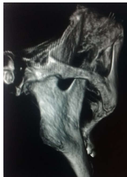
Figure 3. CBCT Reconstructed view showing right condylar ankylosis, obliterated joint space, elongated coronoid process and prominent antegonial notch