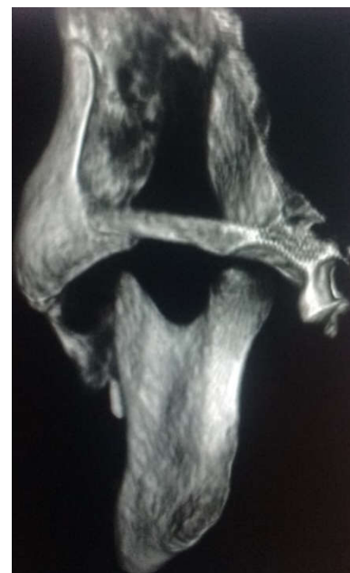
Figure 4. CBCT Reconstructed view showing left condyle which is normal in morphology and joint space can be appreciated