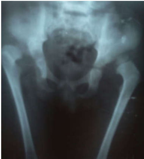
Figure 5. Pelvis radiography showing bilateral hip joint dysplasia