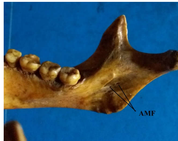
Figure 2. Showing accessory mandibular foramina on medial surface of mandibular ramus

A total of 50 adult dry human mandibles were studied for the position of mandibular foramen. The minimum, maximum, average and standard deviation values of the various parameters which were studied on either side of the mandible are shown in Table 1.