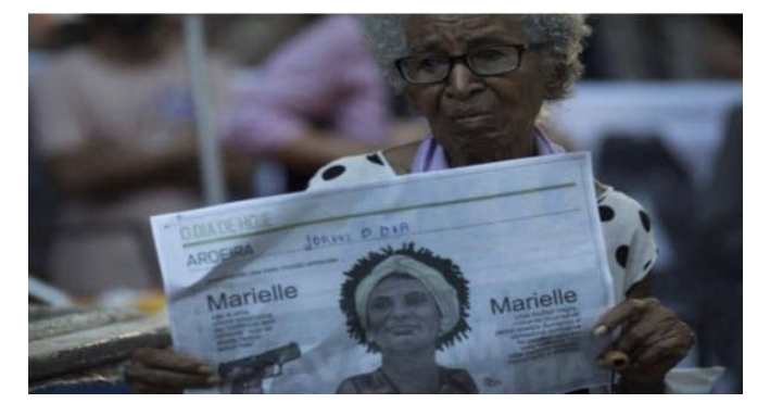
Figure 1. Headline from The Washington Post, March 23, 2018.

By Felipe Araujo March 23, 2018 at 12:00 PM