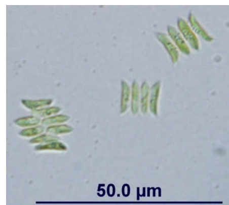
Figure 2. Morphology of colonies of Scenedesmus sp. under a microscope. Scale bar: 20 \mu\text{m}

Acute toxicity tests: The 48h static nonrenewal acute toxicity tests were conducted following the guidelines of the US EPA methods (US EPA, 2002) with two adjustments of: i) light regime (a photoperiod of 12 h:12 h light:dark at a light intensity of ca. 1000 Lux) and ii) temperature ( 27 \pm 1 °C) for tropical species. Neonates of D. carinata (age \leq 24 h) were used for testing. Each treatment had four replicates and each replicate consists of 10 neonates in 40 mL of exposure solution in a 50-mL polypropylene cup. The neonates were fed during the pre-exposure duration but starved during the tests (US EPA, 2002). Cadmium treatments were prepared by spiking Cd in constituted medium prepared with field-collected water. \text{CdSO}_4 \cdot 8/3\text{H}_2\text{O} was used as Cd salt. Five concentrations of Cd were prepared for each metal exposure. Controls were prepared by transferring the neonates into the constituted medium without metal addition. We checked daily for immobilized organisms and removed them from the cups.