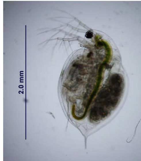
Figure 1. Morphology of Daphnia carinata (adult, female) used in this study

1.2 L beakers with 1.0 L of COMBO medium (Kilham et al. , 1998). The light intensity was approximately 1000 lux. The crustaceans were fed with a mixture of green alga ( Chlorella sp.) and YCT (yeast, cerrophyll and trout chow digestion), prepared according to the U.S. Environmental Protection Agency Method (US EPA, 2002) with a modification to the algal culture medium, which was the COMBO medium. Algae Scenedesmus sp. were culture in COMBO medium.