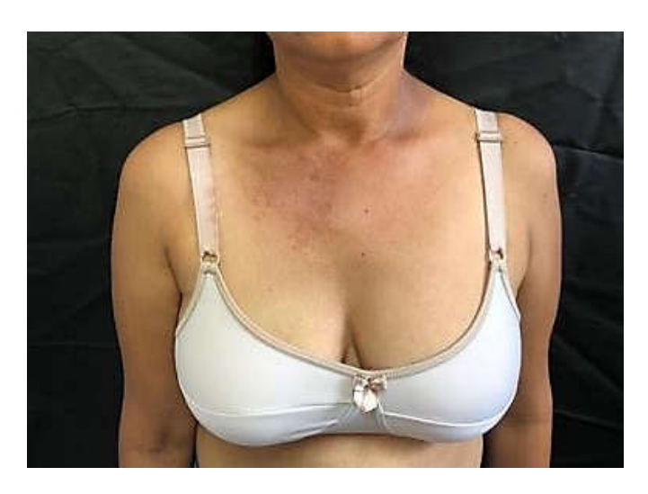
Figure 1: Hypochromic erythematous macules, distributed in the right hemithorax