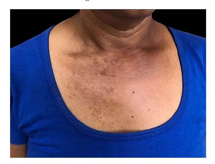
Figure 2. Unilateral linear distribution