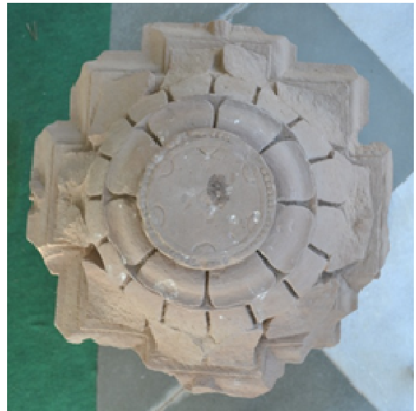
Fig. 2. Mandala, Acc No-1351

type and separated through a circular band (Fig.2). Just below to the outer lotus petal decoration there is a Karnika design separated the flower fringe. Below to it and on bhadra projection has depicted surya image in seating position. He adorned with two lotuses in two upraised hands, there are three horses depicted below to the main deity and the small recess has separated with two pillar decoration. The side projection has depicted with eight door guardian in all direction. Base part of the edifice is plain temple type segment as Bhita , Kumbha and Kapota . At bhita there is chaita window motif carved in four cardinal directions (Fig.3).