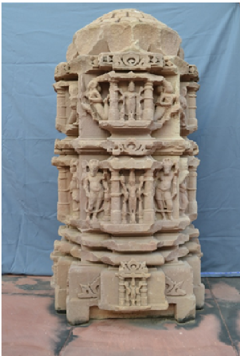
Fig. 4. Sarvotobhadra Surya, Usha-Pratusha and Aswani Kumara, Acc No-1206

Sarvotobhadra available in this series. Like other the top has decorated with four circles of lotus petal and having a circular top. Most of petals are decorated as inverted type and the last circle is damaged. The whole body of the Sarvotobhadra is divided and decorated in three segment Surya depiction so they counted twelve numbers which may represent the twelve month. Just below to the Lotus petal a patti decorated with chaitya window motif followed to diamond design is clearly noticed around the four faces. Further below there is decoration of standing images of Surya in small recess flanked by female deity aiming archer towards either side and they are identified with Usha and Pratusha. Similar type decoration also depicted on other three faces. Lower to the decoration another series of Surya images noticed in which the main deity Surya is depicted as standing position with all their attributes and flanked by Aswani Kumars. All three faces of the series also follow the similar decoration panel. Below to it there is segment of Kapota and Karnika . Further below there is a small recess on the central projection decorated with a small Figure of Surya (Fig.4). In totality there is twelve numbers of images of Surya represent the cycle of solar energy in month wise.