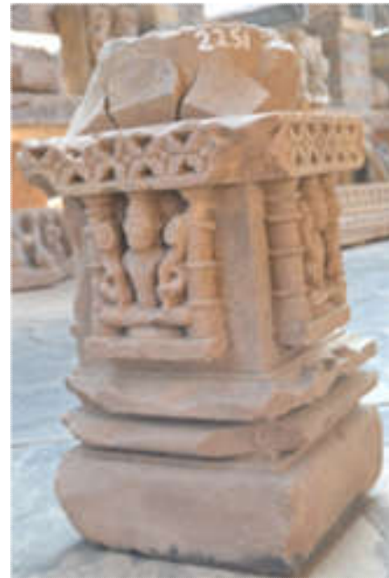
Fig. 5. Seating Surya, Acc No-2251

The upper part Surya images are depicted all cardinal directions along with attendants. All depictions of the series are arranged in seating position. The main deity is holding lotus stalk in their two hands and Aruna is depicted just in front to leg.