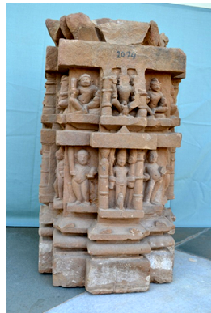
Fig. 6. Surya, attendant, Acc No-2074

The attendants are depicted as in pot belly. The lower image series are decorated as standing image of lord Surya with Aruna. He holds two lotuses in his hands and attendants depicted either side of the image in the second projection which is separated with a pillar decoration. The attendant hold staff and mace head in their hands identified as Dandi and Pingala. The base is no decorative motives and divided as Bhitta , Kumbha and Kapota segments (Fig.6).