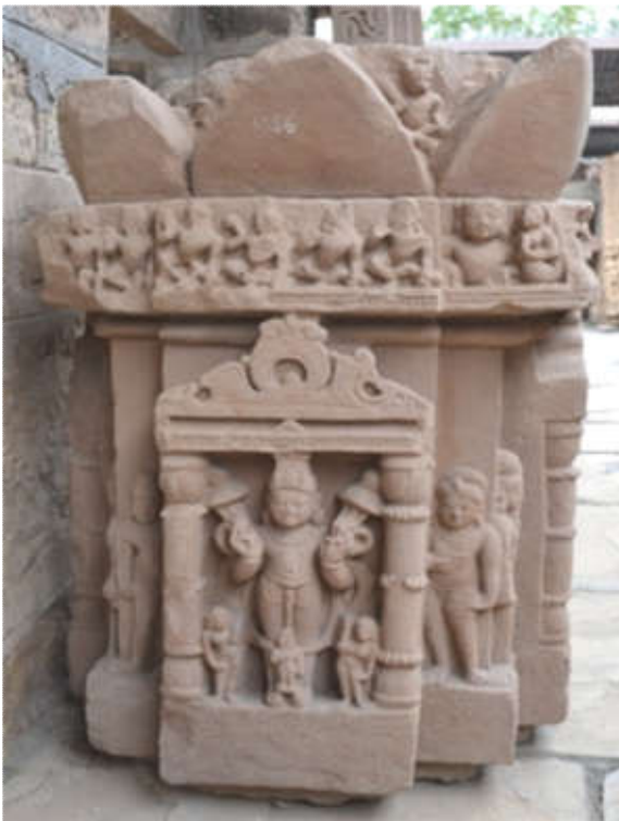
Fig. 1. Standing Surya Sarvotobhadra, Navagraha, Acc No- 1356

The antiquity is measured as 49 x 49 x 69cm approximately and bearing accession number 1356. It is tri-ratha in plan and the bhadra projection has decorated with Surya images at four cordinal direction and top to it has decorated with two phase upraised lotus petal. In between the upraised petal decorated the outer circle; there is seated Figure of Aswani kumara's depicted with mace head type weapons. Just below to the lower series petal all four sides have decoration of different divinities and in respect to that one side decorated Nabagraha panel in which eight Graha has serially depicted but the Surya is absent because just below to the panel in the central projection recess has a standing Surya images. Aruna represent in small form between two legs of the main deity and either side flanked by Usha and Pratusha and attendant in side projections. In other side there is a reclining mother and child depicted with shampooing female attendant along few more attendants. This side is also Surya image depicted with attendants. The other side upper series of decoration are not identified where as god Surya represented as similar to the other bhadra projection (Fig.1).