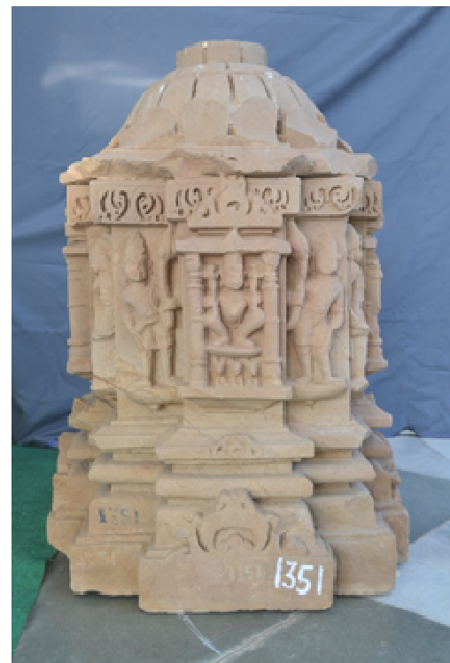
Fig. 3. Tri-ratha, sarvotobhadra Surya with Dandi and Pingala, Acc No-1351

It is measured as 60x60x 120cm approximately and bearing the accession number 1206. It is also constituted under tri-ratha plans and more height comparative to other