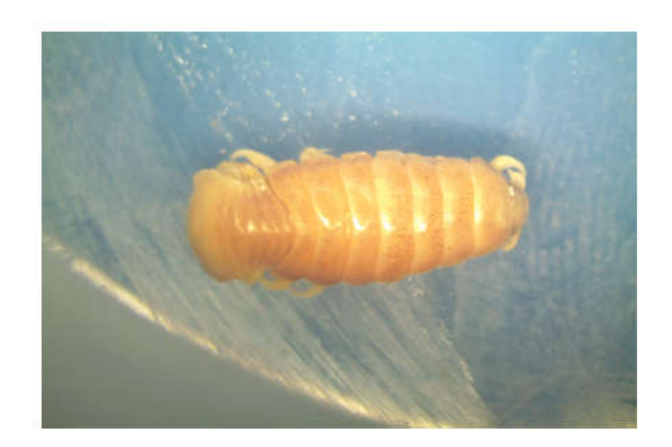
Plate 8. Dorsal view of the Cymothoa sp. parasite

Investigation of infected intestine of C. chanos showed presence of Sclerocolum sp. with prevalence of 100%. Fish species C. crenidens was infected with Gnathia sp. and Lernanthropus sp. in the gills, however, Procamallanus sp. were also recorded in the intestine of the fish. Gnathia sp. and Lernanthropus sp. were detected in the gills of P. gaterinus fish, Plate (11) and (12).