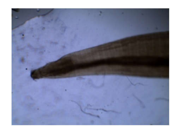
Plate 1. Anterior part of the body of adult nematode Procamallussp. Parasite

Four external parasites were detected in gills of most fish species collected from the study area, these were Ganthia sp., Aella sp., Lepeophtheirum sp. and Lernanthropus sp., Lepeophtheirum sp. and two helminth parasites Sclerocolum sp. and Procamallnus sp. were reported inside the intestinal tract of some examined fishes.