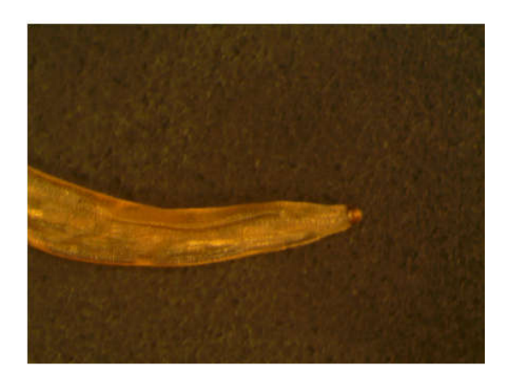
Plate 3. Anterior part of the body of Adult acanthocephalan Sclerocolumsp. parasite

Infection rate among fish species: Total number of fishes examined in this study was 164 fishes. Total prevalence of parasites infection among all fish was 64.02 %, However M. cephalus fish recorded highest prevalence of infection with 40.85 %, S. rivulatus recorded