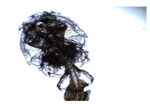
Plate 9. Anterior part of the body of Lepeophtheirum sp