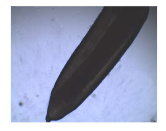
Plate 2. Posterior part of the body of adult nematode Procamallussp. Parasite