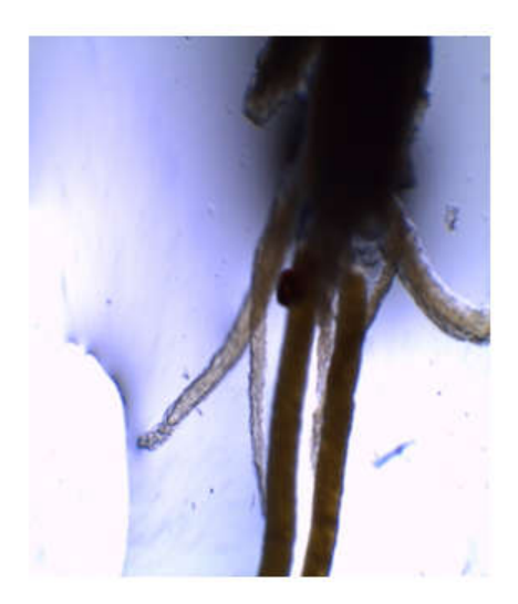
Plate 12. Posterior part of the bodyof Lernanthropussp. parasite

Although the fishes examined showed high intensities of parasites infection, never the less no pronounced symptoms of disease were observed. Abdou and Mahfouz (2006) stated that Sclerocollum sp. predominated in posterior region of intestine appeared swollen with anterior ends of some worms projecting into the peritoneal cavity and enclosed in a connective tissue capsule at site of proboscis attachment, the surface of intestine appeared thickened and with high mucus.