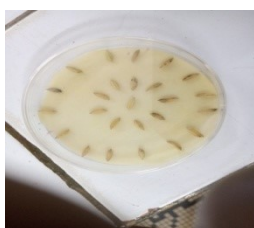
A : Sanitary test

Experimental set-up: The experimental set-up is a completely randomised block comprising eight treatments (T) with three replicates, including an absolute control. T0: absolute control; T1: treatment with L. multiflora essential oil ; T2 : treatment with C. schoenanthus essential oil; T3: treatment with O. americanum essential oil; T4 : treatment with combination of L. multiflora and C. schoenanthus essential oils; T5 : treatment with combination of L. multiflora and O. americanum essential oils; T6 : treatment with combination of C. Schoenanthus and O. americanum essential oils T7 : treatment with combination of essential oils of L. multiflora , C. schoenanthus and O. americanum .