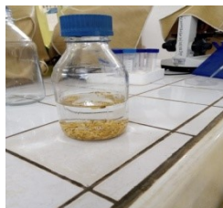
B : Soaked rice grains