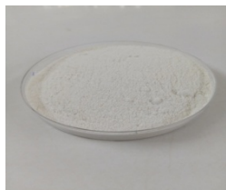
C: Rice flour

Parameters assessed: To assess the efficacy of essential oils against M. oryzae , the percentages of germinated seeds and rotted grains were evaluated at 7 th day after inoculation. For the germination test, the percentage of germinated grains, the percentage of sound ungerminated grains and the viability percentage of rice grains were assessed at 15 th , 30 th and 45 th day after storage (DAS). The viability percentage is obtained by adding the percentages of germinated grains (GG%) and sound ungerminated grains (GSNG%).