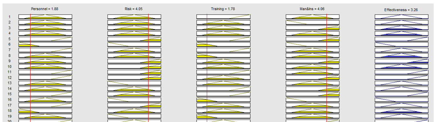
Figure 3. Output of the System

The Personnel factor demonstrates the attitudes of all workers in the establishment towards occupational health and safety and the effect of these attitudes on opinions regarding the success of relevant practices. The Risk Analysis factors demonstrates the opinions of the workers to what degree the risk assessments performed in the establishment were taken into account and to what degree these assessments reflected on the practices. After this stage, the correlation between the factors was examined. Taking into account their correlation with the effectiveness variable, training, personnel, risk and