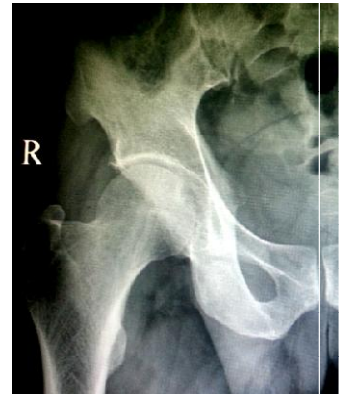
Figure 2. Digital X-ray showing left side fracture neck femur and Singh index grade 3 on right side